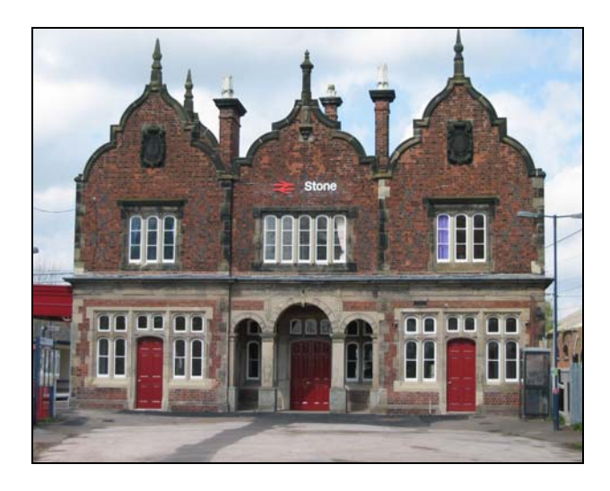
Refurbished railway station, Stone