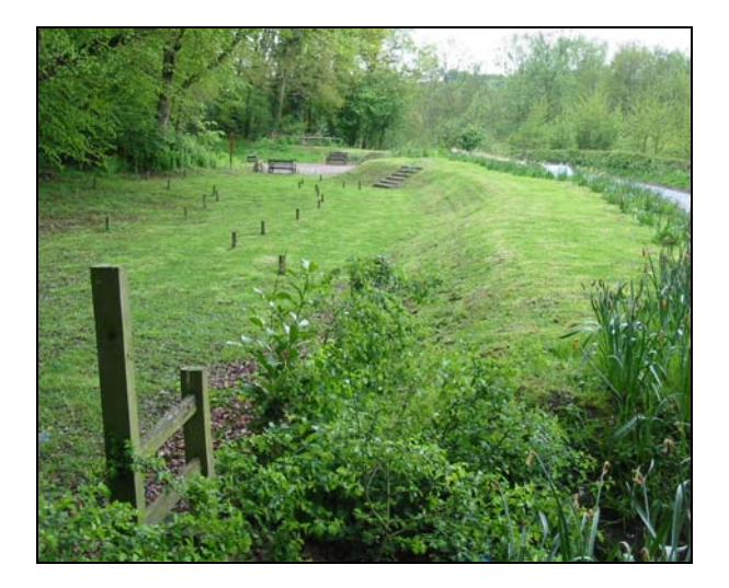
Copmere picnic site, Eccleshall (recently enhanced through Parish Council efforts)