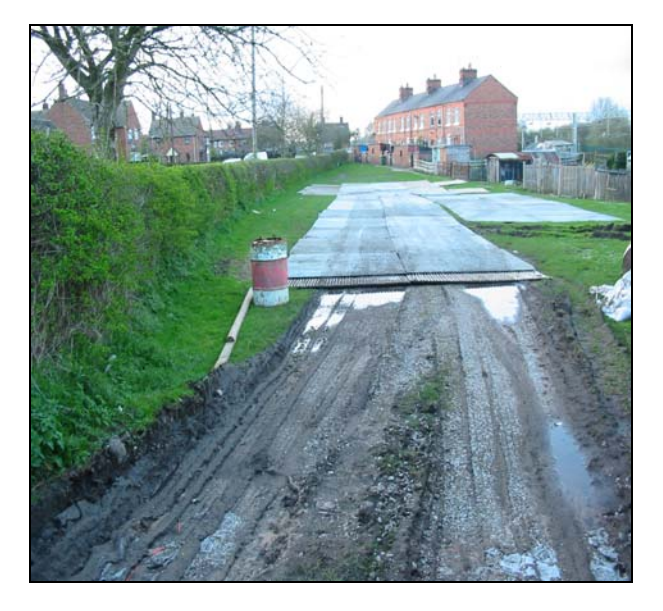
Open space in Chebsey damaged by railway work