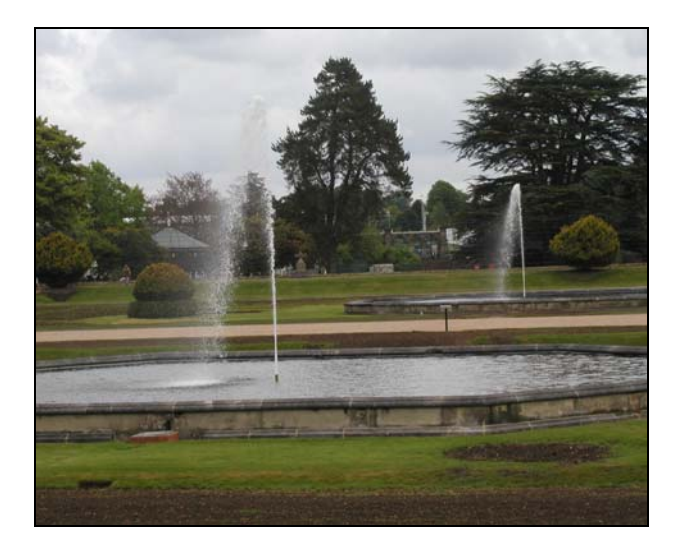
Fountains - Re-opening of Trentham Gardens (May 2004), Swynnerton