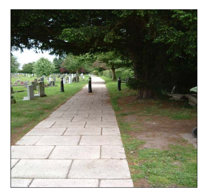
New path close to the burial ground, Gnosall