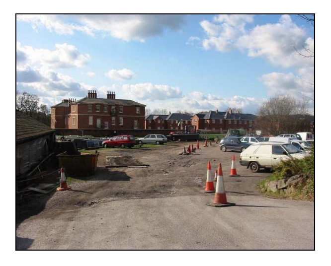
Canal-side car park, Stone