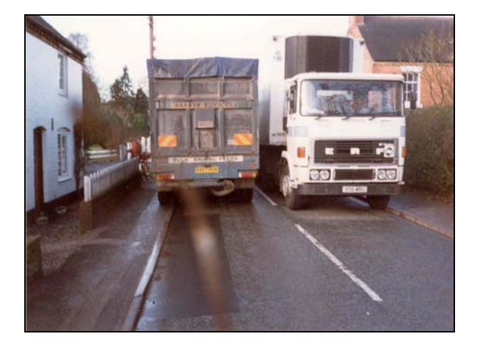
Restricted road capacity, Gnosall

..... and the sorts of areas and developments people like and enjoy