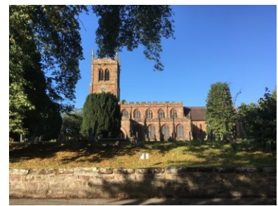
Bench 15 and opposite 17 and 16 Holy Trinity Church