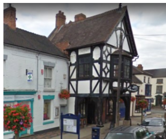
Opposite bench 19 on the High Street Historic building

Starting in the Town centre, bench 1, proceed easterly for approximately 1045m (3/5 mile), passing the Little George seventeenth century coaching house and benches 2,3 and 4 to Fletchers Garden Centre with teashop, miniature railway and Gentleshaw Wildlife centre.