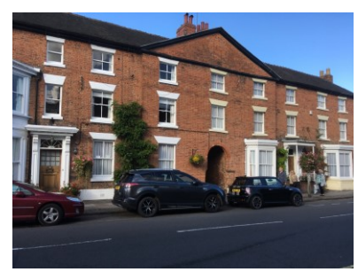
Between benches 16 and 19 Eighteenth Century Houses on High Street

Continue for 339m down the High Street with its many historic buildings, library, shops and Town Clock to Bench 19, outside the old bank. Proceeding 73m further down the High Street towards the mini roundabout reaches Bench 1.